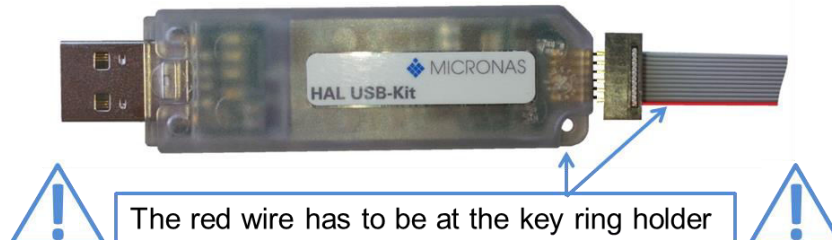
Figure 2: Cable connection