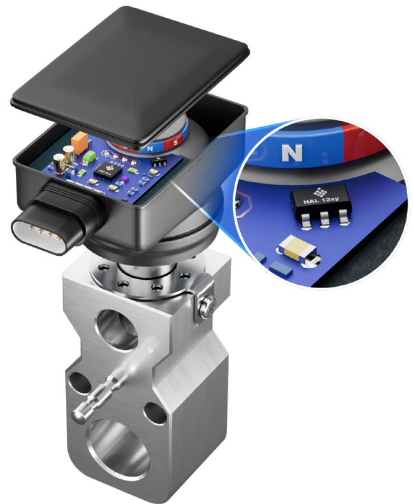
Fig. 2: Application: Expansion valve